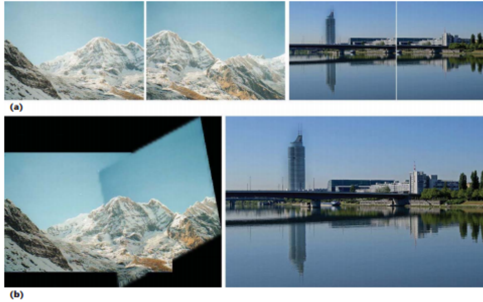
Figure 2. Example project 1. Image stitching student project (a) input and (b) output.