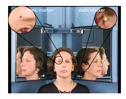
Figure 1: Dynamic and static facial markers and the two mirror capturing video equipment in usage at VMU.

Many methods have been introduced [3, 5, 7] for capturing and analyzing facial expressions. Shu et al. [8, 9] used classification based on local binary patterns ( LBP ) [12] to evaluate the degree of palsy using